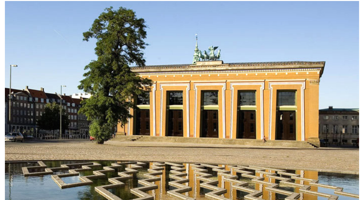
Thorvaldsens Museum (museum visit) Bertel Thorvaldsens Plads 2 1213 Copenhagen K

Dedicated to expanding our understanding of nineteenth-century studies internationally, the inaugural CNCS international conference aims to 'take the temperature' of nineteenth-century studies internationally. We have therefore invited a range of speakers from all over the world, representing the widest possible institutional constituencies including independent research organizations, university and national research centres, and professional organizations. They include academic staff, postgraduate students, postdoctoral researchers and professional curators. We welcome them to CNCS International and hope they will become integral components in the core membership of CNCS International.