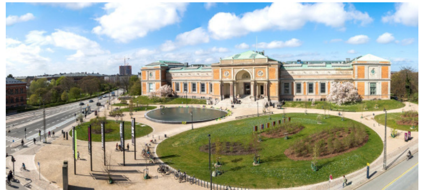
Statens Museum for Kunst (museum visit) Sølvgade 48-50 1307 Copenhagen Ø