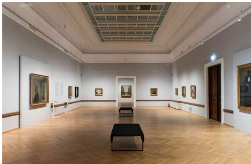
Vilhelm Hammershøi. Light and silence . Exhibition at the National Museum in Poznan 21 XI 2021-06 II 2022